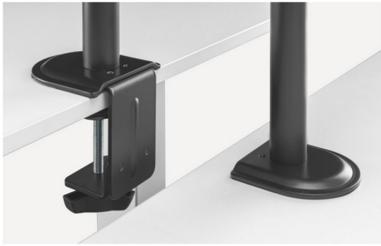
Clamp/Grommet Base with 2-in-1 design